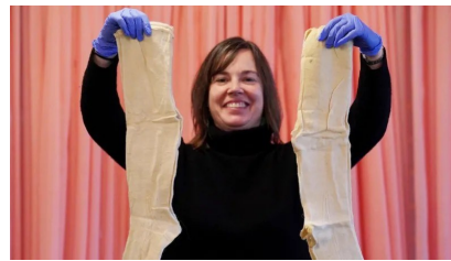
Women's knee-length stockings were also discovered among the ship's cargo

As was customary for the time the Anne-Marie's cargo - or prize - was confiscated, along with its mail box.