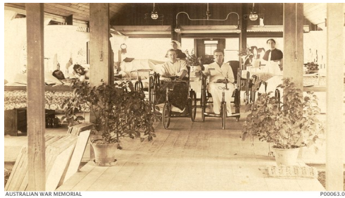
Rosemount Hospital after WW1